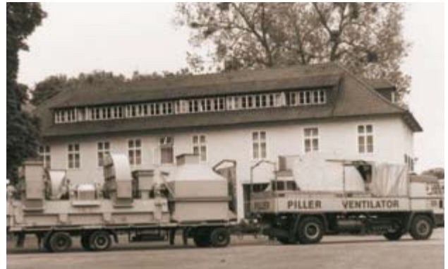
Osterode – administration, approx.. 1975