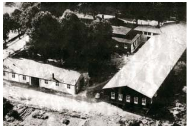
Piller Moringen in the 1940s