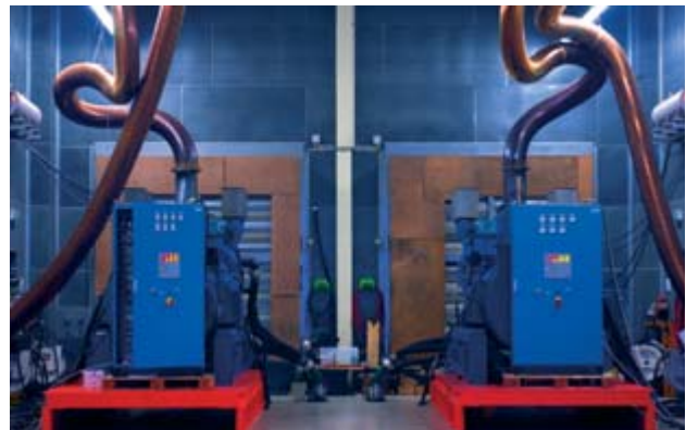
Diesel UPS under test at Bilshausen