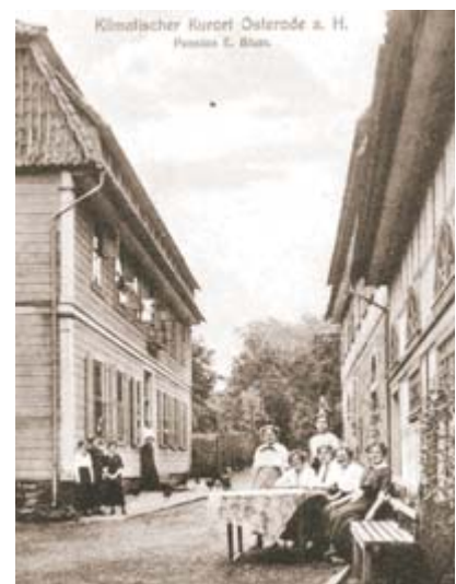
Approx. 1900. Until the acquisition by Anton Piller, the premises was used as a finishing school.