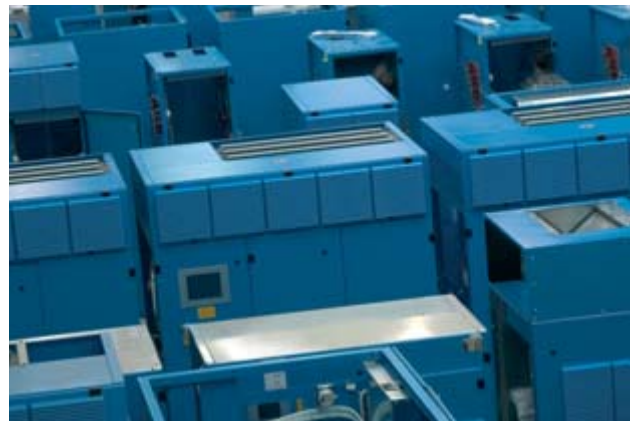
Uniblock units in production

Today, Piller has approx. 800 employees worldwide, more than 500 of them in Germany.