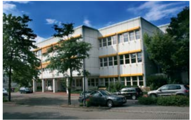
Osterode - Administration and Engineering

As one of the most outstanding innovations in the range of UPS technologies, Piller develops and installs the first watercooled UPS system worldwide.