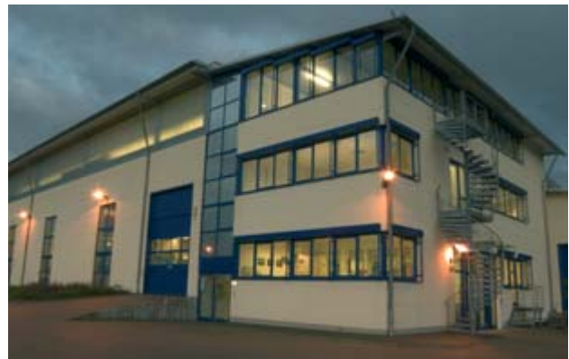
Bilshausen - Piller Test & Assembly

Daughter companies in Italy (Piller Italia S.r.l.) and Spain (Piller Iberica S.L.U.) are founded.