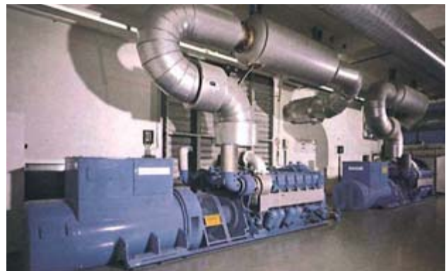
Piller Diesel UPS