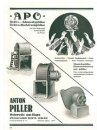
Brochure from 1927

Until 1945, both factories in Osterode and Moringen continued to expand along with their production capacities.