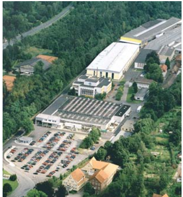
Piller Headquarters & Manufacturing Facility - Osterode